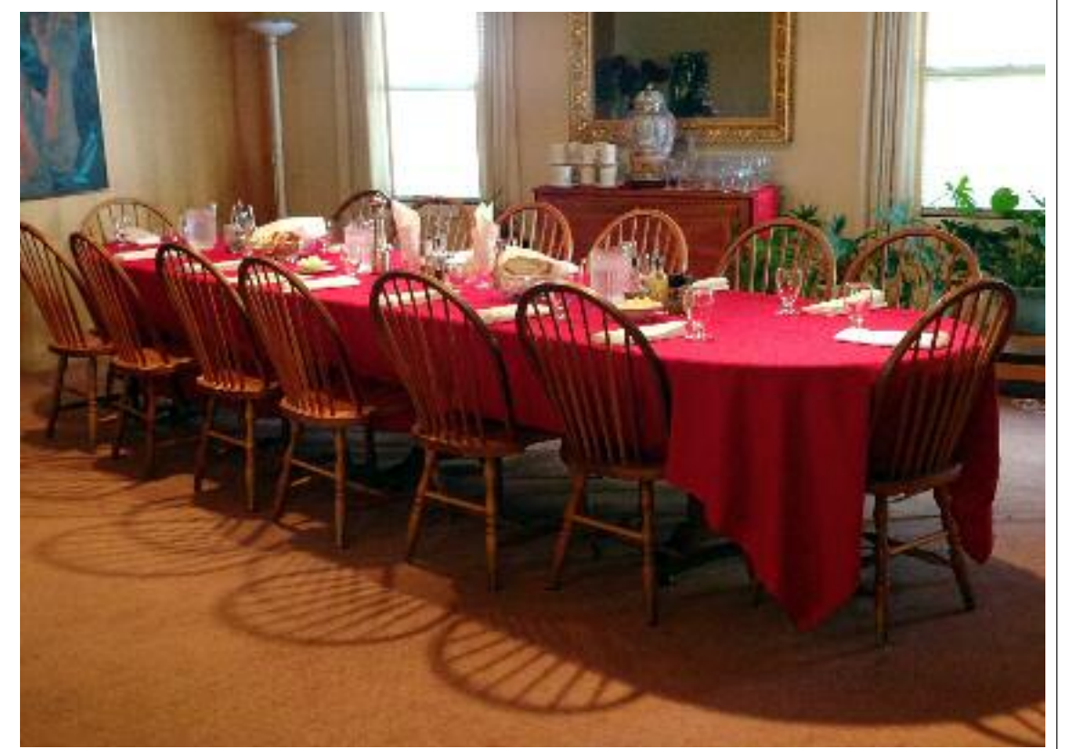
A simple table set with bread and soup awaits a small group for discussion at Saint Mary's College.